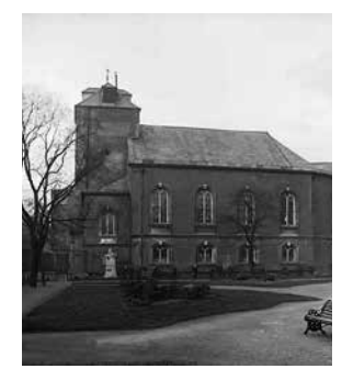
Park View C.1902

We offer a free self-guided tour and history brochure, detailing our historic rich past. Please feel free to grab one from reception. Whether you're a curious culturephile, a thirsty tourist or a hungry shopper, come inside and experience a setting like no other and our unique offerings at The Church Café, Bar & Restaurant.